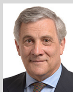
Antonio Tajani MEP EPP, Italy