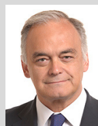
Esteban González Pons MEP EPP, Spain

Consult here for the updated list of MEP members of the EPCF